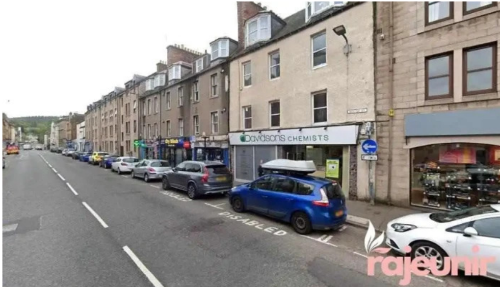
Davidsons chemists perth perth