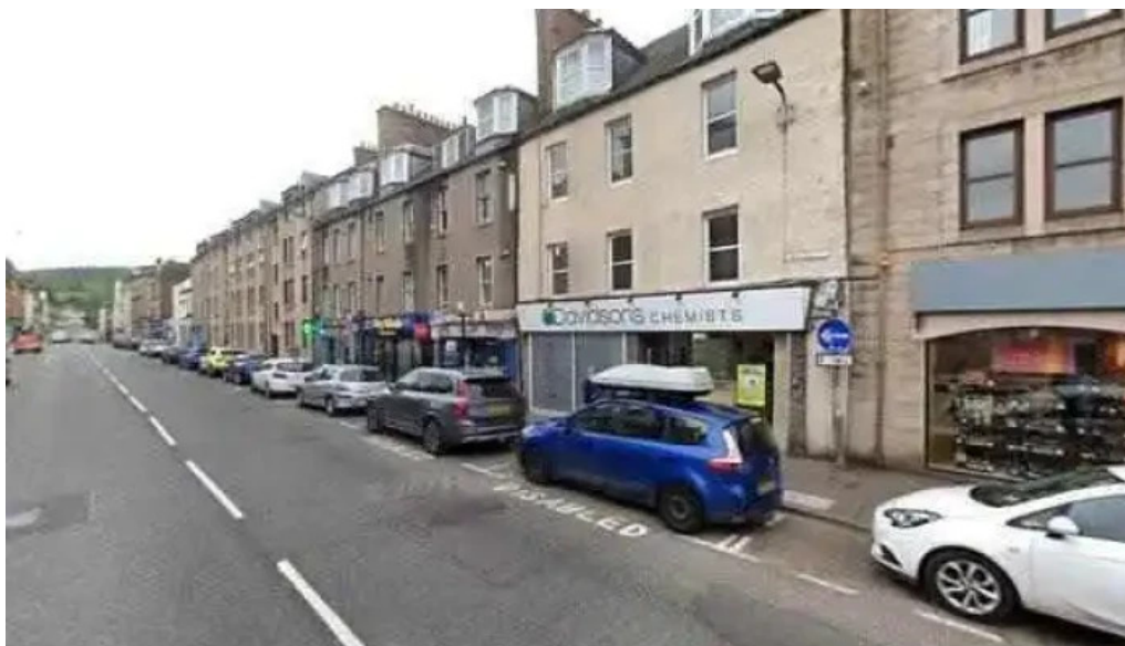
Davidsons chemists perth all