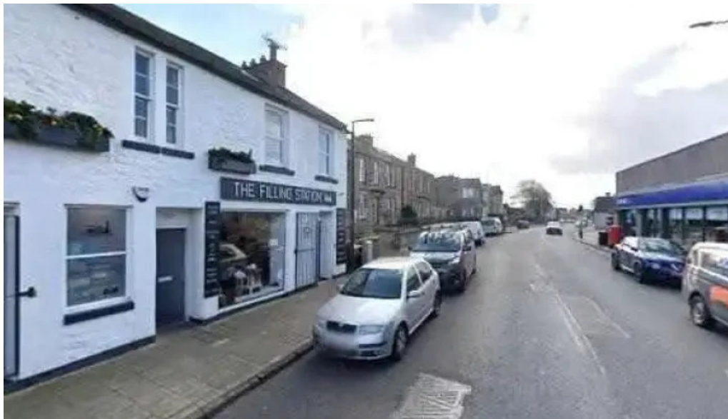
Well pharmacy street view 360deg