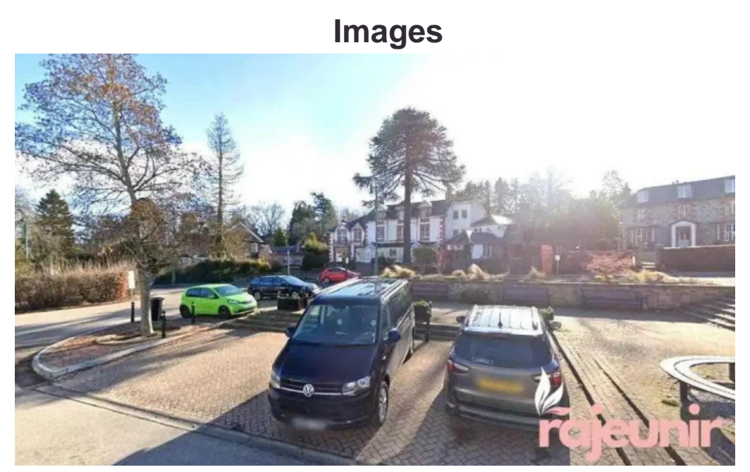
S p a pharmacy Itd strathpeffer

In case you want to alter any element that you believe is not precise related to this site, we urge you to forward a message so that we will fix it as soon as possible. Thank you in advance thanks.