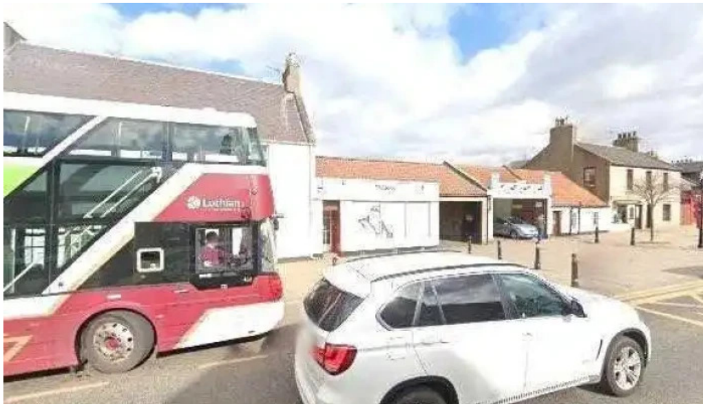
Well pharmacy street view 360deg