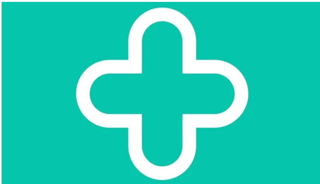
Well pharmacy by owner