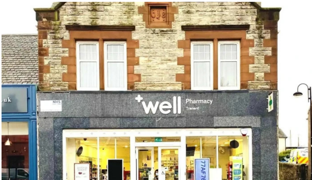
Well pharmacy all