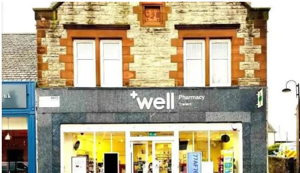
Well pharmacy tranent