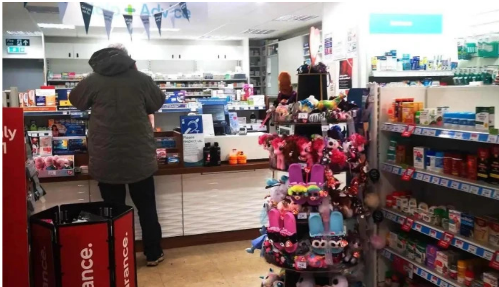
Well pharmacy all