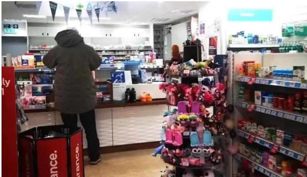
Well pharmacy tranent