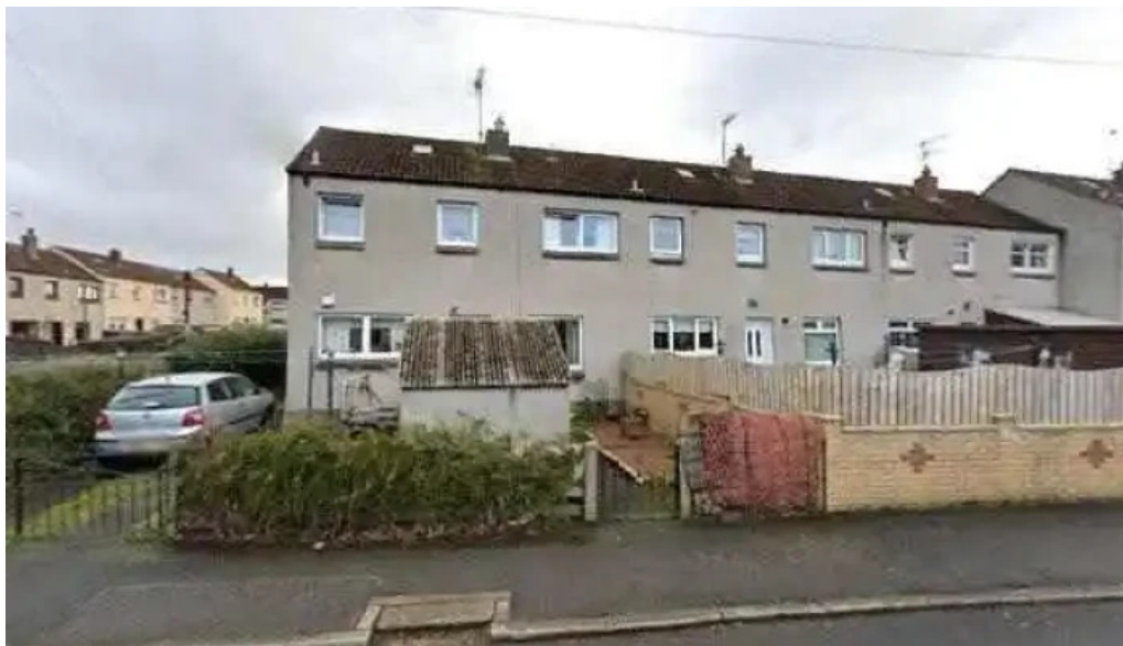
Well pharmacy street view 360deg