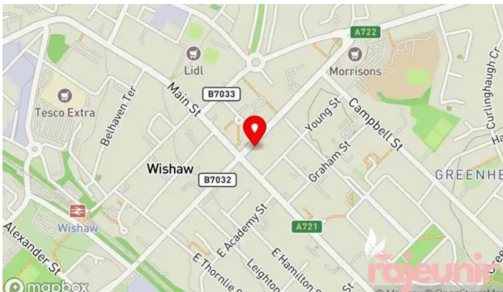
Amiry gilbride pharmacy map