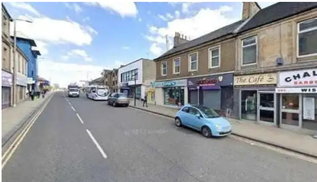
Amiry gilbride pharmacy street view 360deg