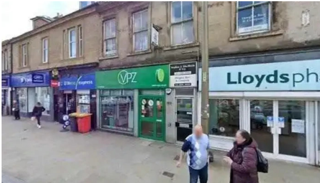
Mcmminns pharmacy travel clinic wishaw all