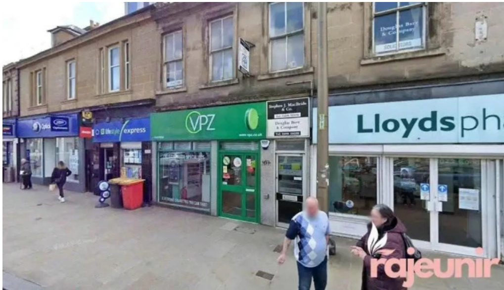
Mcminns pharmacy travel clinic wishaw wishaw