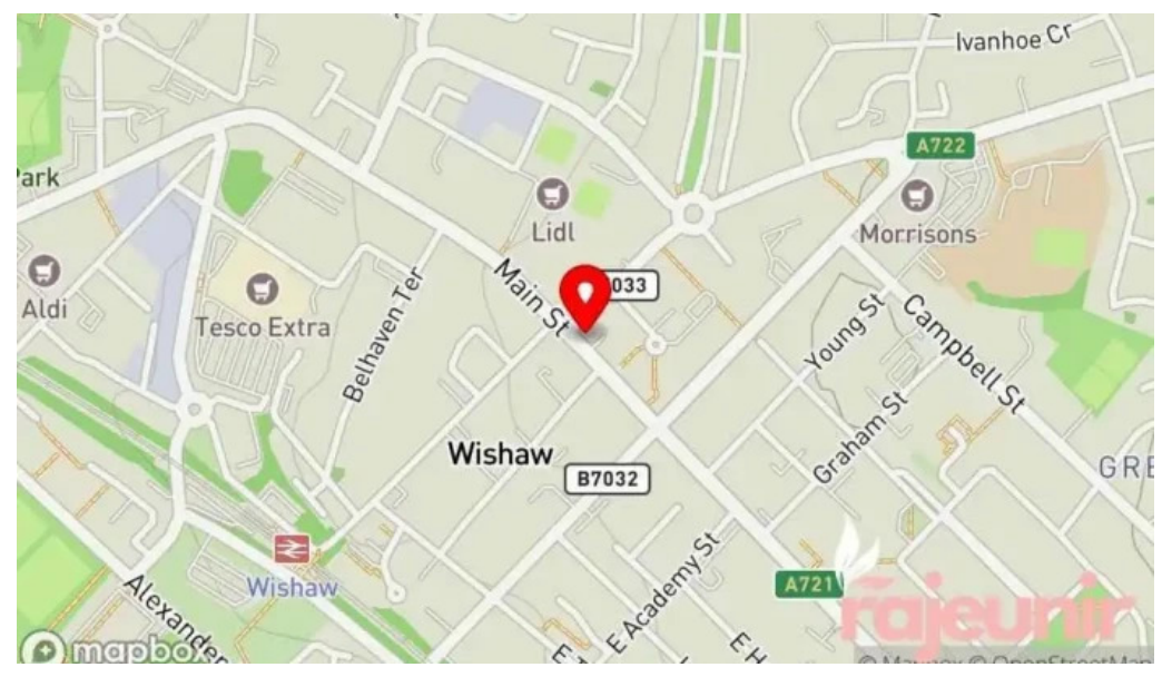
Well pharmacy map