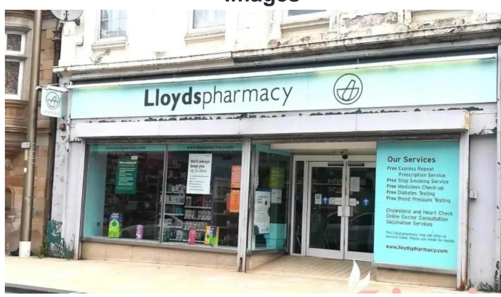
Well pharmacy wishaw