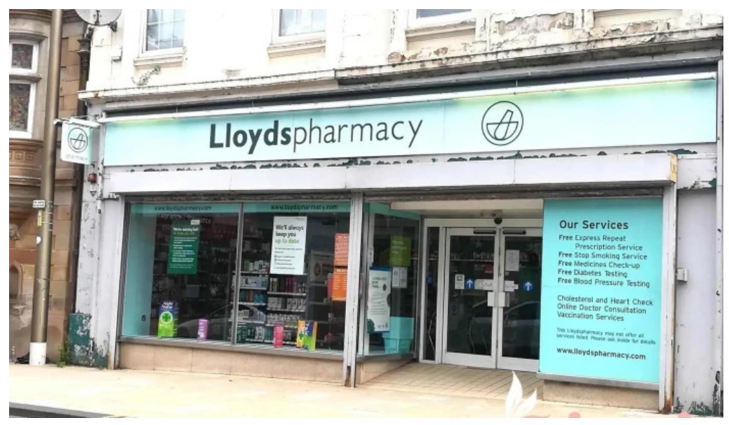
Well pharmacy all