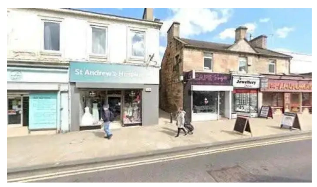
Well pharmacy street view 360deg